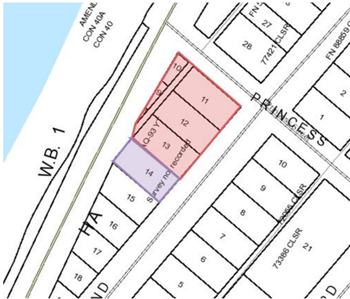
Figure 1. Approved Consolidation Configuration